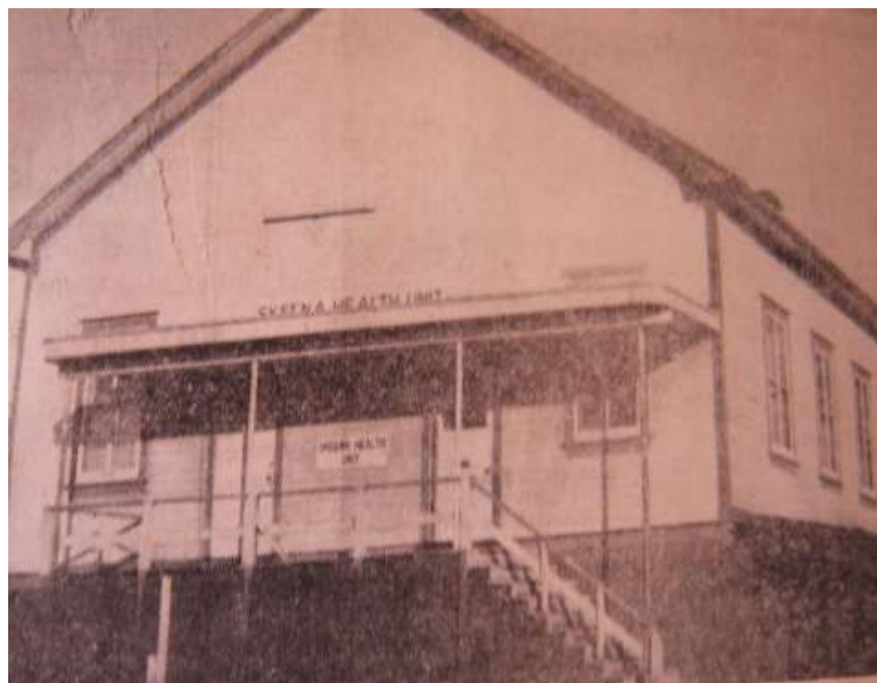
Figure 1 Prince Rupert (later Skeena) Health Unit

UNBC Terrace Campus 4837 Keith Avenue Terrace, BC V8G 1K7 Phone: 250-615-5578 Fax: 250-615-5478 Email: nw-info@unbc.ca