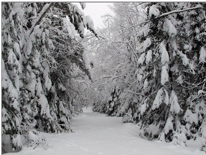
An untouched Martin Trail, with trees hanging with snow. Beautiful!

REMINDER: Share your information about recent publications, grants, and/or other honours you may have received with others interested in future NRESi issues.