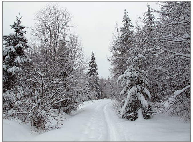
How peaceful! A photo from the Forests for the World.