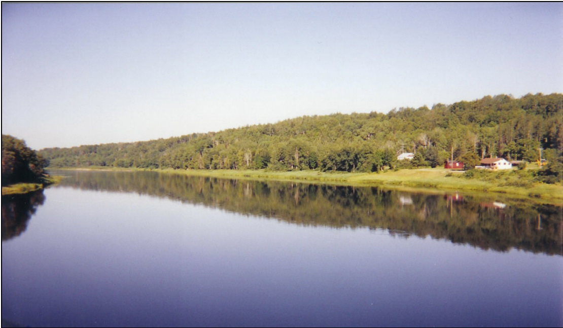
“The Mighty Miramichi”