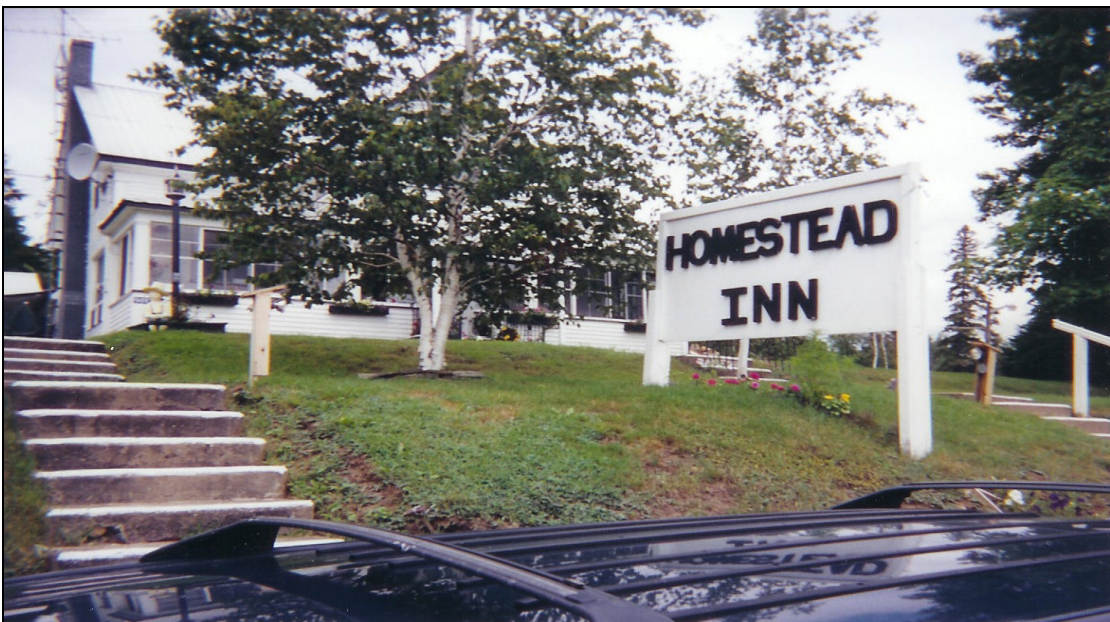
A Blissfield Bed and Breakfast