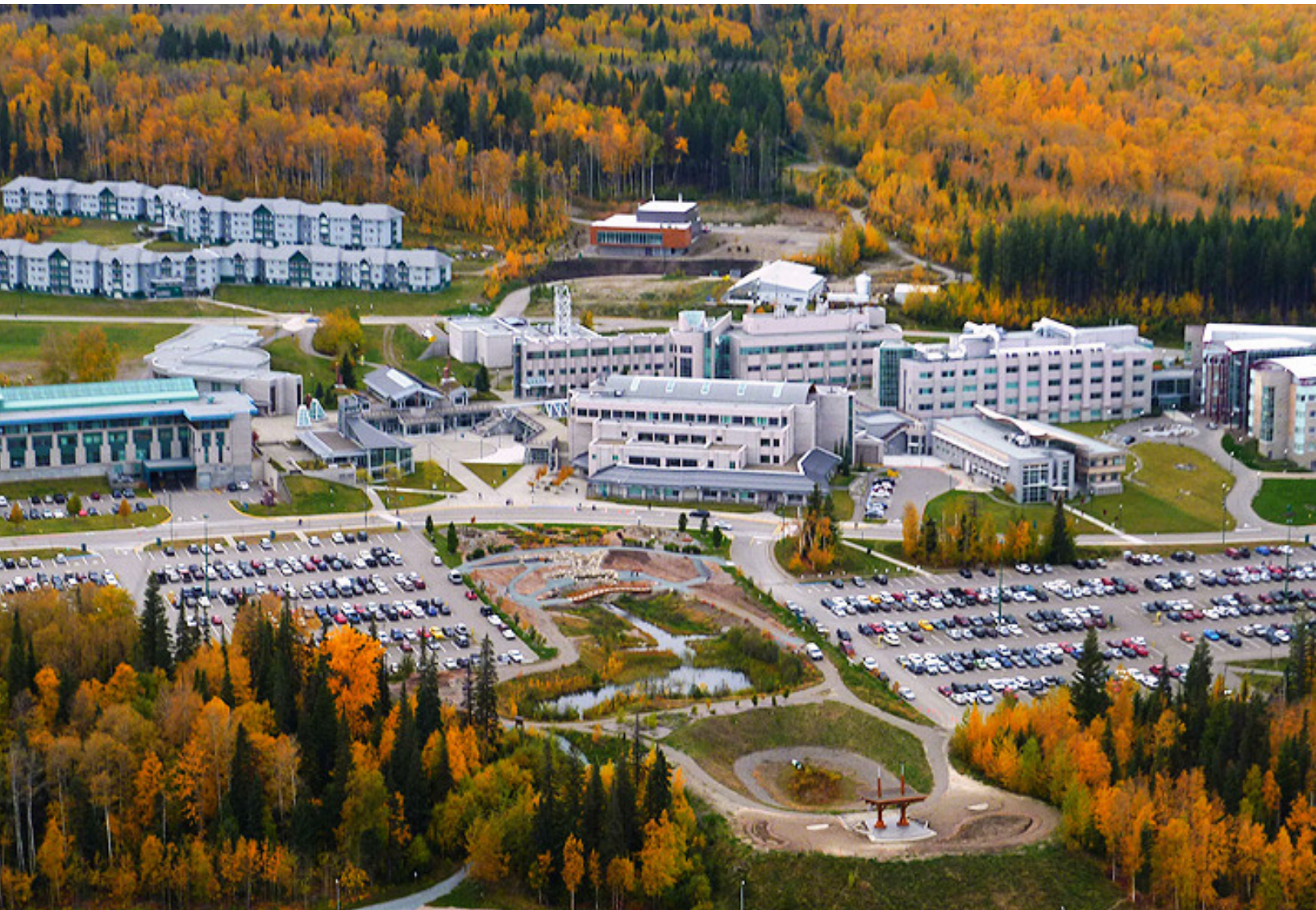
Image: UNBC Prince George campus aerial view