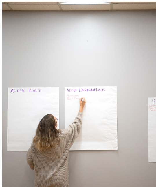
Image: 2019 Northern BC Research and Quality Conference workshop