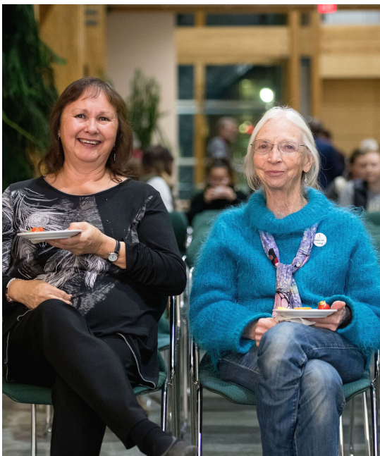
Image: Let's Talk Aging and Technology in the North event, November 6, 2019