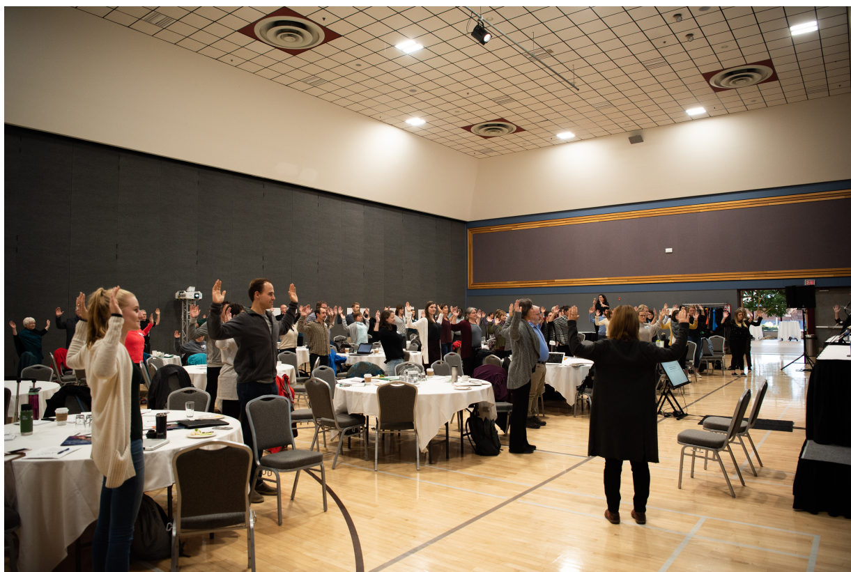
Image: Participants at the Physical Activity and Health Summit take a stretch break