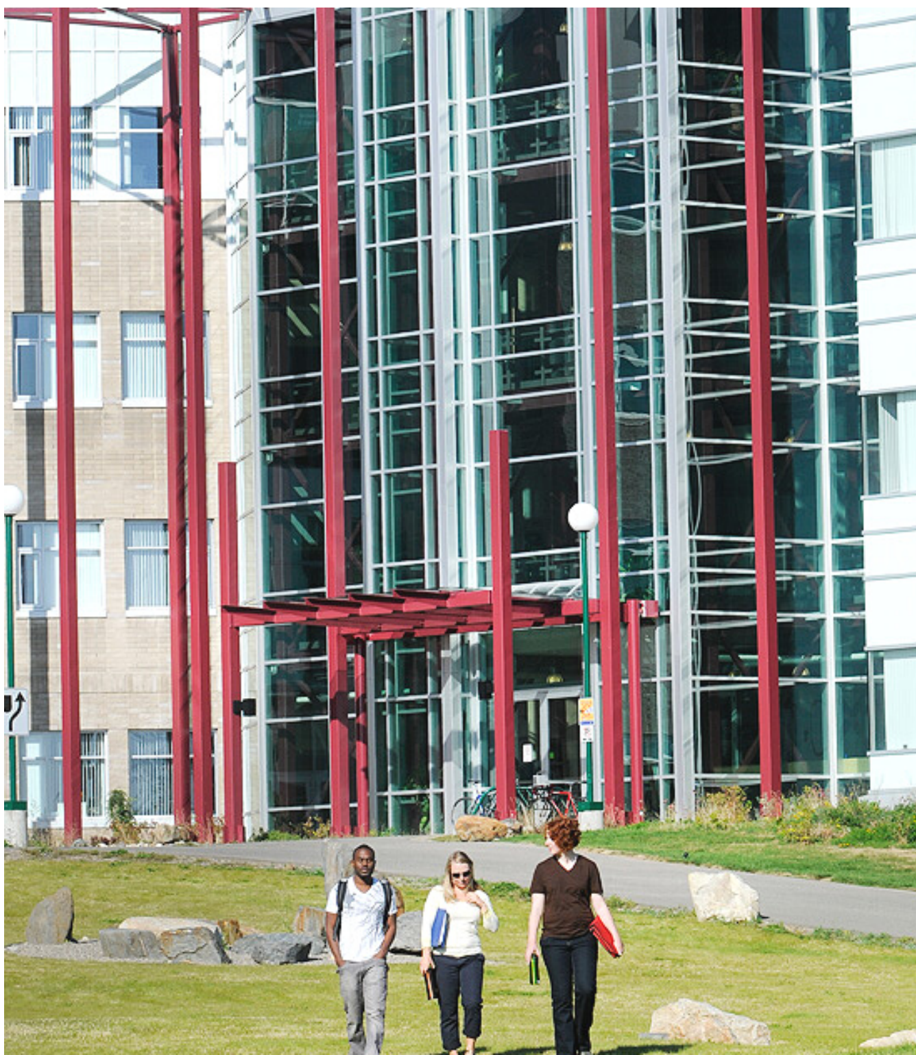
Image: The HRI manager and staff are located in UNBC's Teaching and Learning Building