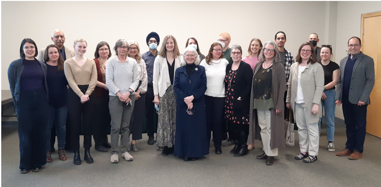
Image: Health Research Institute Annual General Meeting