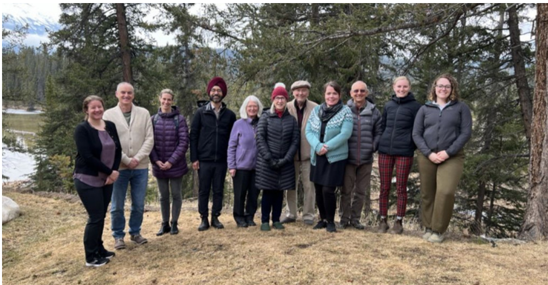
Image: BC SPOR SUPPORT Unit Methods Cluster research team & HRI staff at the Hermeneutic Approach to Implementation Science Writing and Knowledge Translation Workshop.

The HRI organized the Better Together for Health Research In Northern BC meeting with those involved in health researchers, as a venue to update and discuss key developments for supporting health research in northern BC.