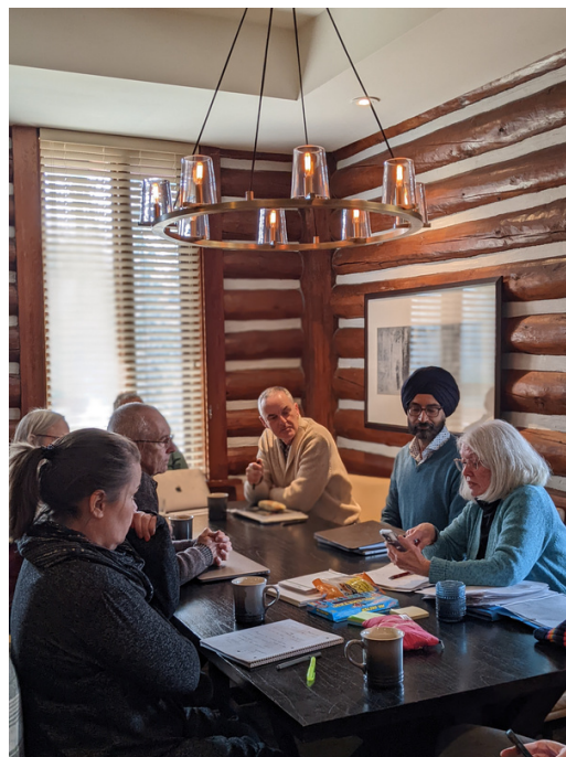
Image: BC SUPPORT Unit Methods Cluster Workshop