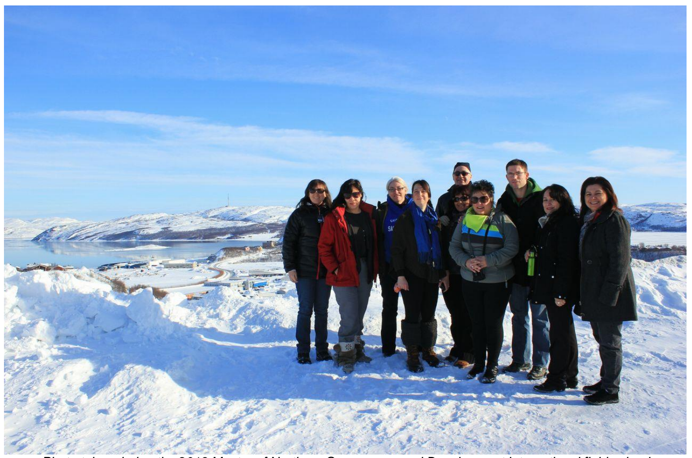
Photo taken during the 2013 Master of Northern Governance and Development international field school (Kirkenes, Norway – March 2013)

For more information: visit www.usask.ca/icngd or email info.icngd@usask.ca.