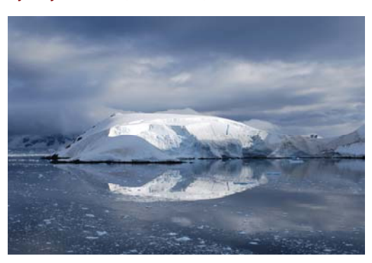
Fantastic reflections from Skorntop Cove