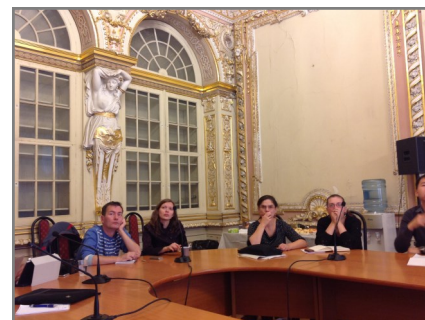
A photo of the gold-encrusted venue