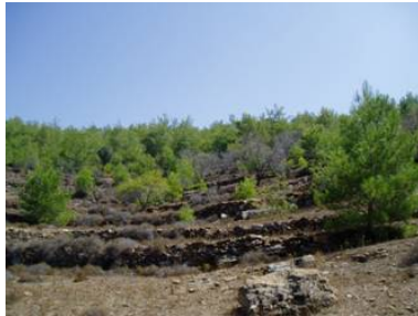
Thousand year-old terraces of soil along the Mediterranean sea

in Turkey. They would like to establish the extent of agricultural practices in the Catalhoyuk site (ca. 7,400 BC) and to understand the phosphorus cycling in soils that has been under cultivation for thousands of years.