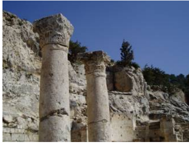
Ruins of the Byzantine Alahan Monastery, ca. 5 th century