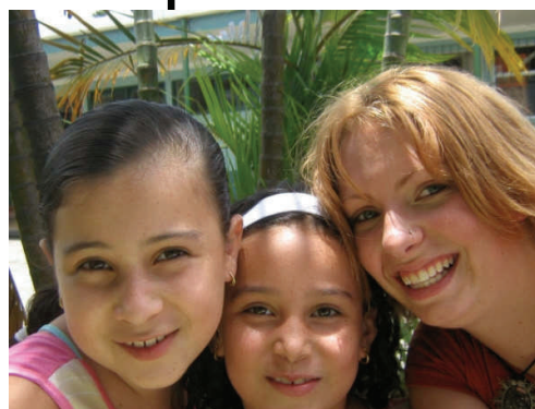
Here is a picture of other tourists interacting with people at a resort

While it may be hard to have a truly authentic experience while traveling, forging relationships with the local population could help make a front stage experience seem more authentic. There are many types of scenarios in which you can build a relationship. If you are lucky to gain access to the backstage, make friends with the residents who live there. These people aren’t concerned with the tourists and can give you valuable insight into their culture and society. If you tend to stay in the front stage areas, try to make friends with those who work there. Who knows what you might be able to learn from the bartender or the maid who work at the resort your staying at.