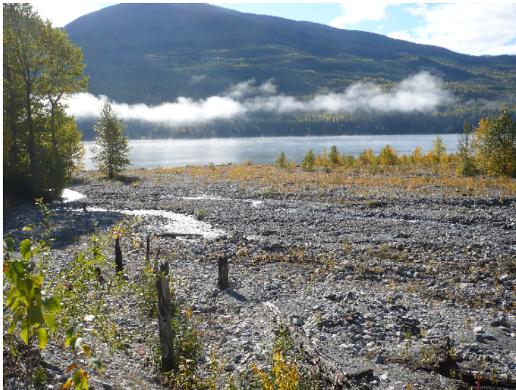
Figure 2: Pine creek

We have also investigated Pine creek, which drains a non active gold mining area. At this location we also did a temporal and a spatial analysis of metal content in the fine sediments. (figure 2).