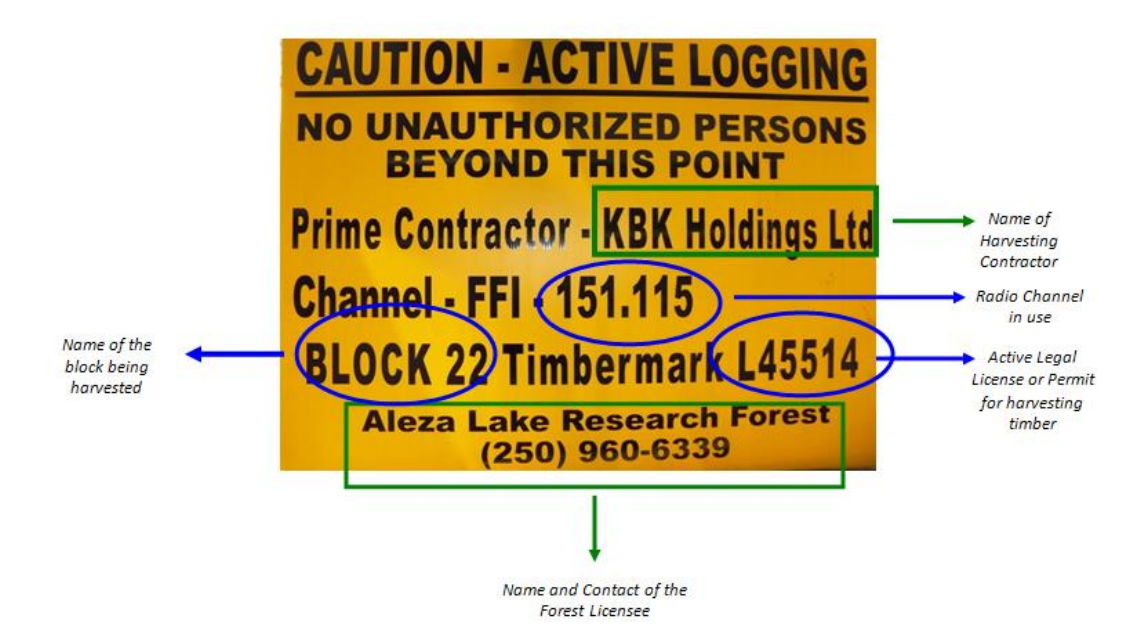
Figure 3: Typical signage indicating industrial activity in the field – could be found at the entrance to a hauling road and/or harvest block

Before driving on logging roads, check current activity and road conditions by contacting the BC Ministry of Forest District Office for the area you are in. A website is available which tracks active logging and some resource use (<a href="www.for.gov.bc.ca/mof/regdis.htm">www.for.gov.bc.ca/mof/regdis.htm</a>). Make sure you are able to interpret the posted road signage for radio frequencies being used. Contact the owner/manager to let them know you will be traveling, obtain maps, find out about industrial traffic patterns and active operations and clarify which radio channels are in use.